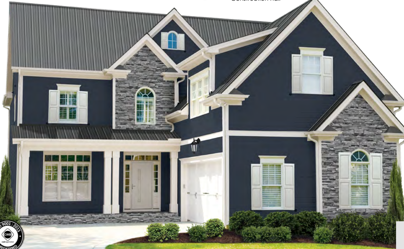
Newport D4.5 colonial - Abyss blue

For more information about Duchesne vinyl products or to consult our availability chart, contact your local dealer or visit our website WWW.DUCHESNE.CA .